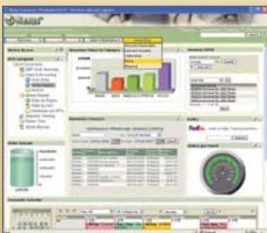
Nexus Portal provides application Frameworks, Executive Dashboards, Web Menus & Enterprise Content Management (ECM) for all your apps

Trademarks mentioned are those of BCDi or of their respective owners. © 2008 BCDi