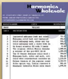
Invoice with overlay sent as a PDF using Catapult, then indexed and archived in the Nexus ECM